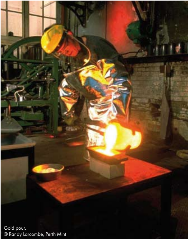
Gold pour.